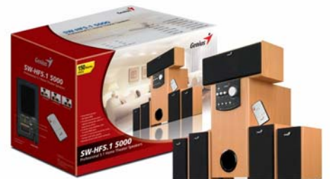
Color: Light Wood