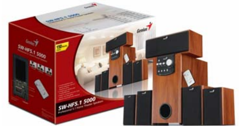
Color: Dark Brown

Contact with your sales representatives for more information.